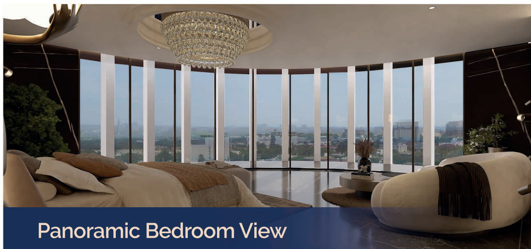
Panoramic Bedroom View